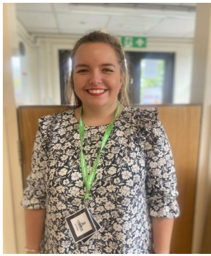
MISS ASHWORTH NURSERY