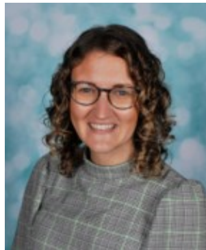
MISS ISHERWOOD RECEPTION